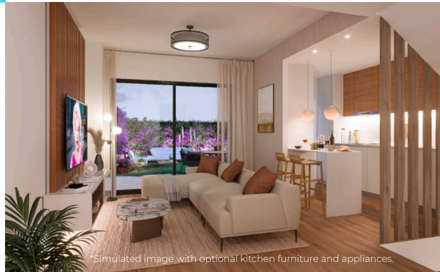
*Simulated image with optional kitchen furniture and appliances.