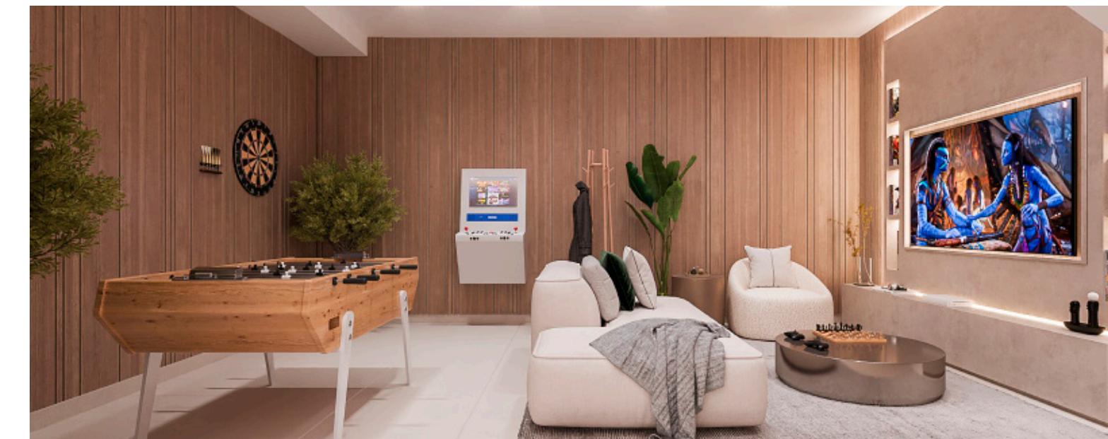
*Simulation of leisure area with optional finishes.

Just a few minutes away from Los Nogales Living, you can enjoy a variety of services such as restaurants, supermarkets, medical centres, cultural centres, etc. You can also easily access the A7 motorway to visit your favourite destinations.